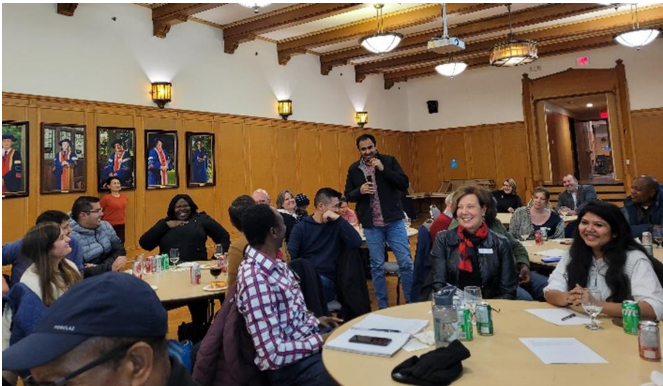
Photo: Last November, RRU students and CIC Victoria members came together for pizza, refreshments and to listen to and reflect on the presentation Reflections on Canada...Past, Present and Future .