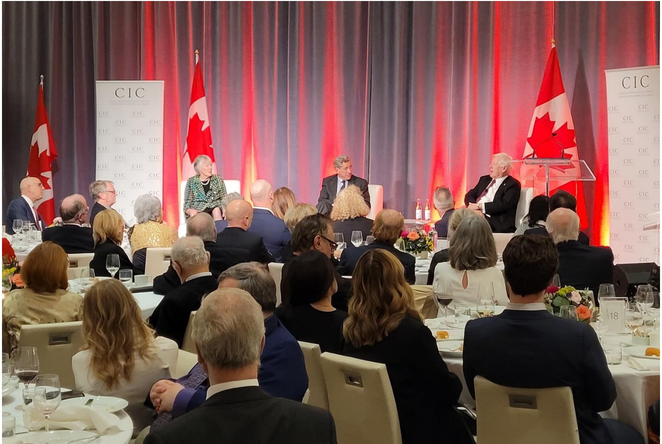
Professor Margaret MacMillan and the Honourable Bob Rae discuss current events and the war in Ukraine at CIC's inaugural Bill Graham Lecture Series dinner held in Toronto in March 2023.