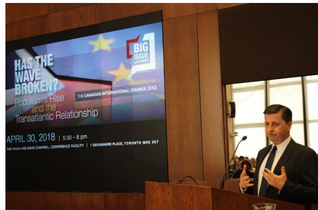
The Right Honourable Douglas Alexander gives the inaugural Big Issue Lecture "Has the Wave Broken? Populism's rise and the transatlantic relationship."